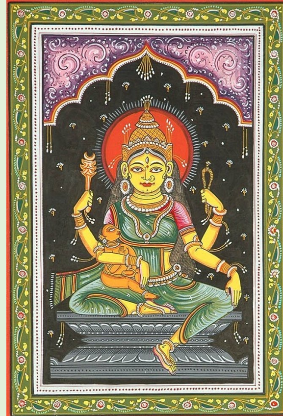
Goddess Indrani Queen of the Heavens