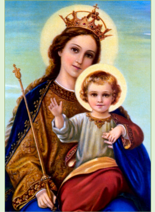
Mary – Co-Redeemer; Queen of Heaven and Earth Mediatix